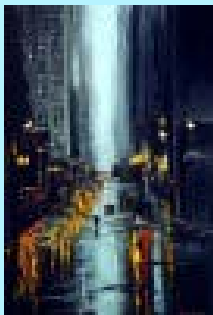
"The Lights That Shine" by Ruslana Levandovska

"This piece shows the resilience of the temporarily ghost-like city that is the effect of COVID-19, giving new character to our beloved streets. But it is sure to return in strength!"